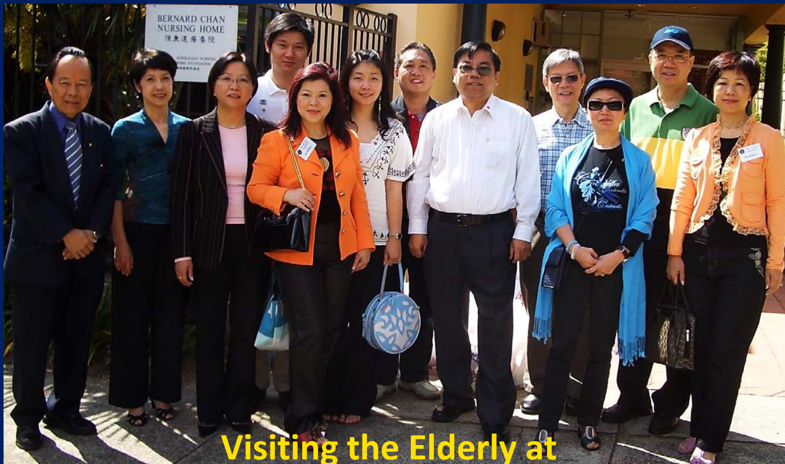
Visiting the Elderly at Australian Nursing Home Foundation in 2006