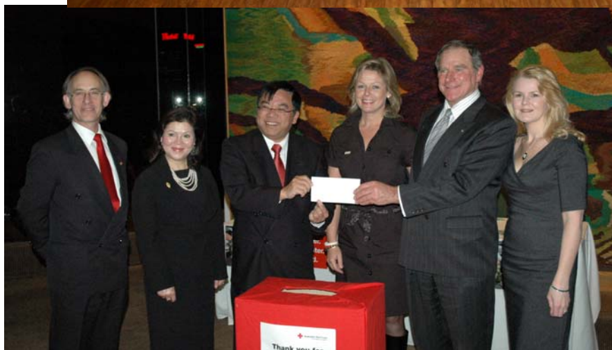
Cheque Presentation at Premier's Dinner at Parliament House