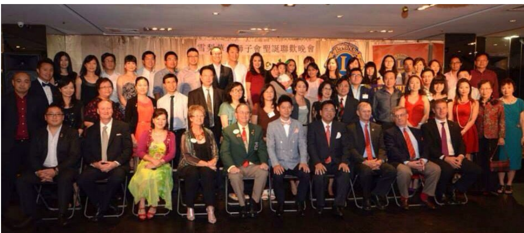
Members and VIP Guests at Sydney Chinese Lions Christmas Party 2013