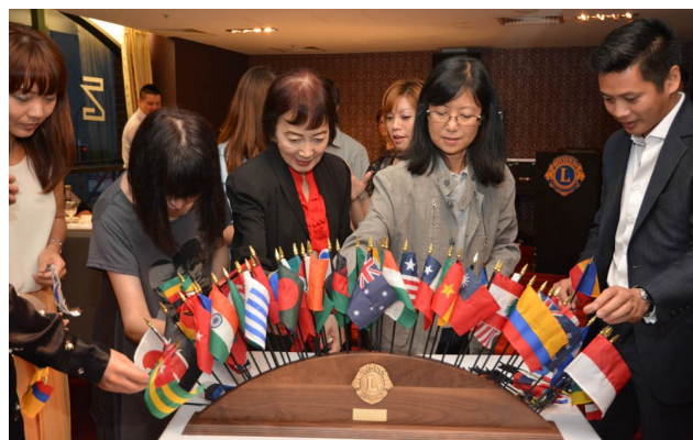
Sydney Chinese Lions Inserting Flags onto the Wooden Base

Of the three categories above, the one with 41+ members is arguably the heavy weight class in membership terms. Clearly, winning an award in this category would be the most difficult amongst the three as it entails keener competition in recruiting new members amongst the larger and more successful clubs within the Constitutional Area.