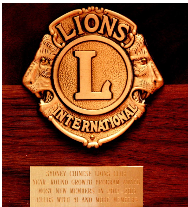
Lions Eblem and Plaque on the Wooden Base