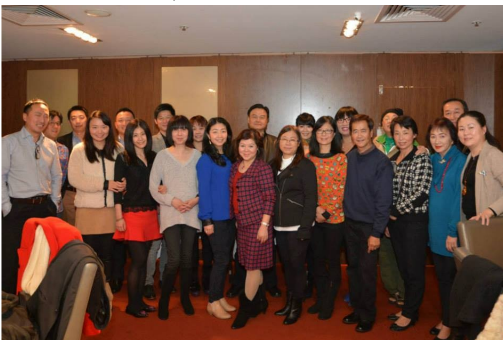
Group photo at July 2014 Member's Meeting