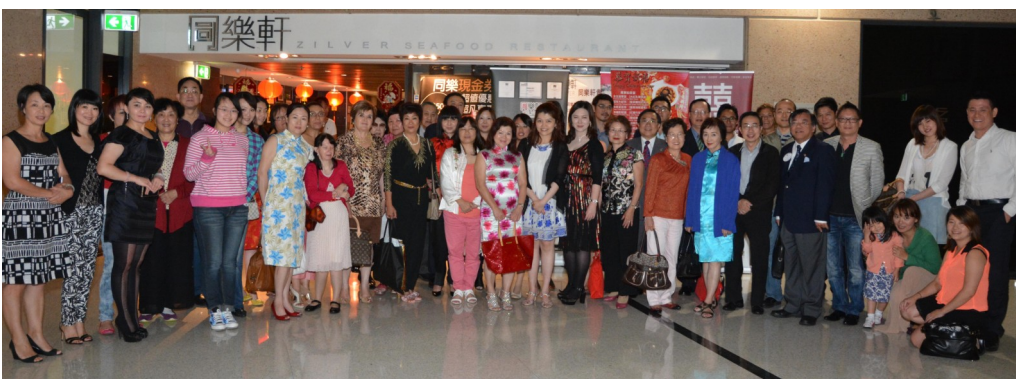
Group photo at February 2014 Member's Meeting