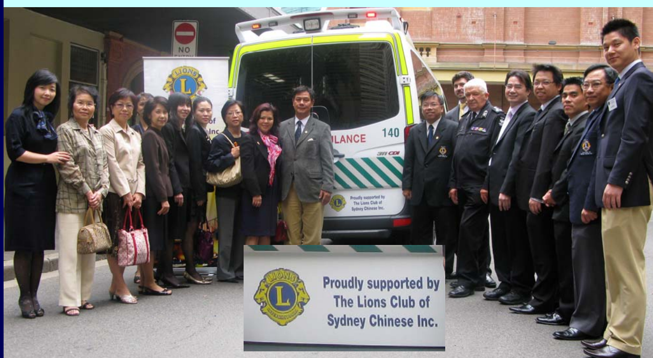
Proud Sydney Chinese Lions with the Ambulance they Proudly Donated to St John (NSW)