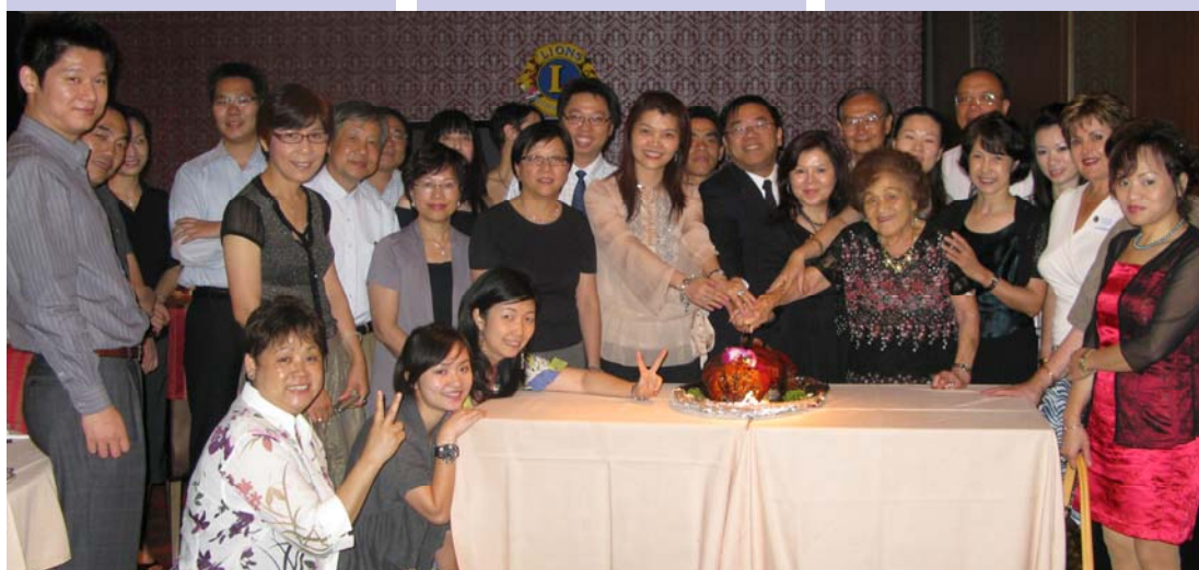
Sydney Chinese Lions at February 2009 Members Meeting