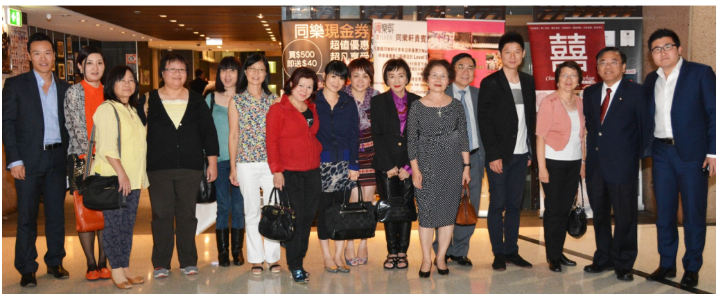
Sydney Chinese Lions and Guests at October 2013 Members Meeting