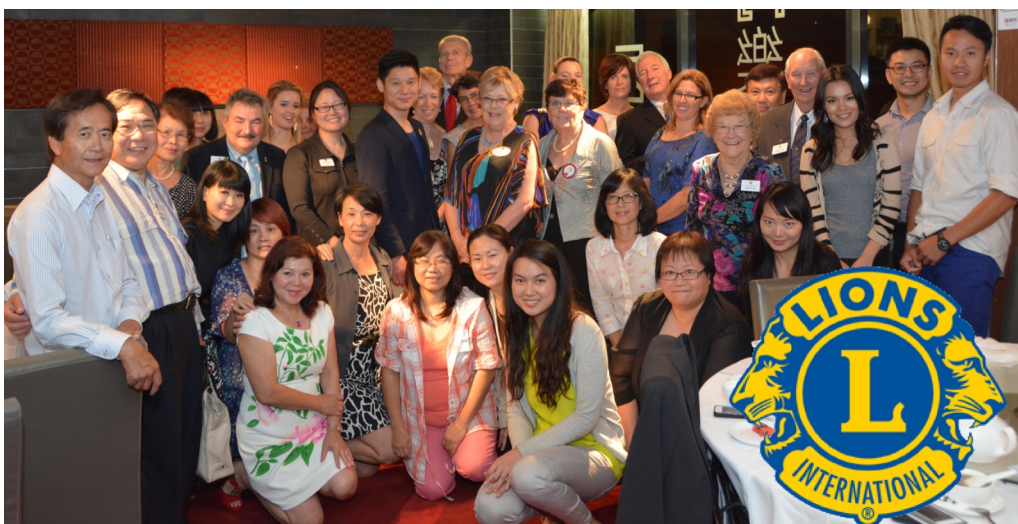
Sydney Chinese Lions and Guests at March 2014 Members' Meeting