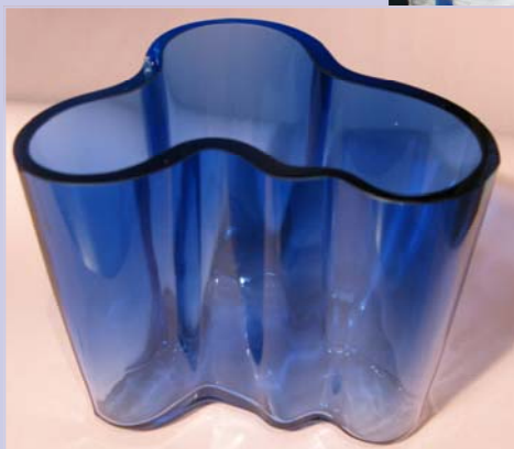
The Souvenirs presented to Sydney Chinese Lions