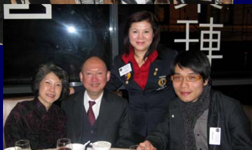
Sydney Chinese Lions and Guests at August 2009 Members Meeting