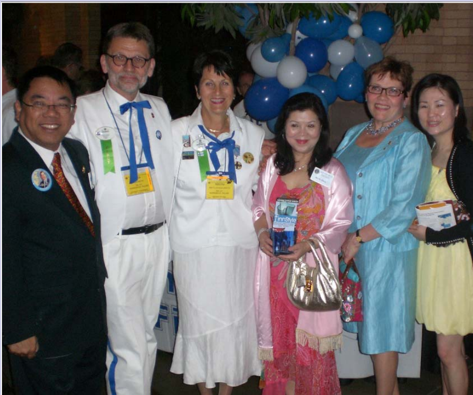
Sydney Chinese Lions with Finnish Lions Friends at Scandinavian Reception