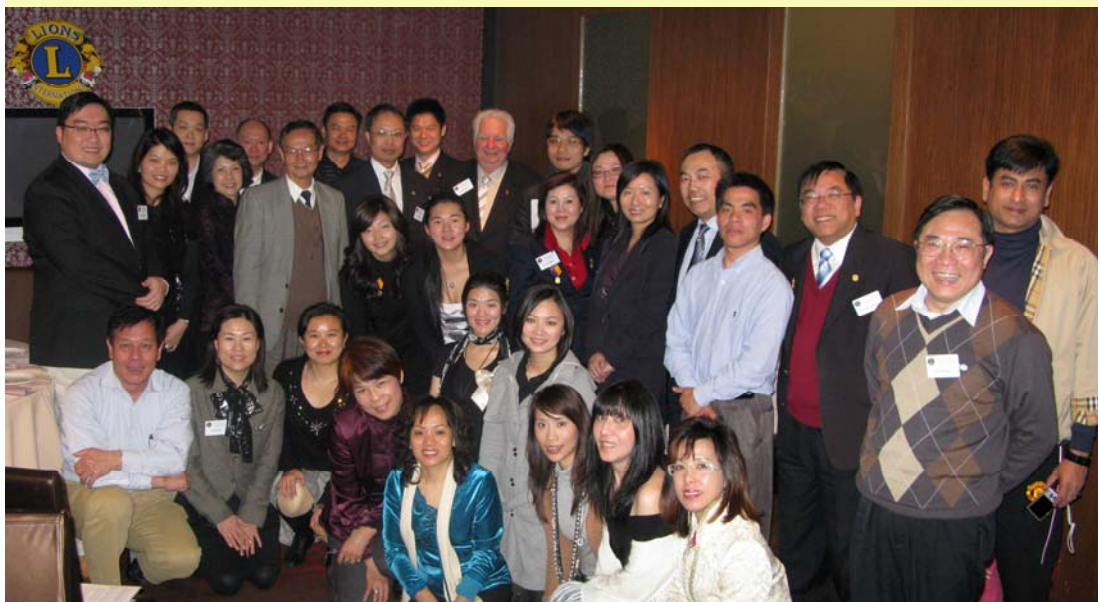
Sydney Chinese Lions at Monthly Members Meeting on 5 August 2009