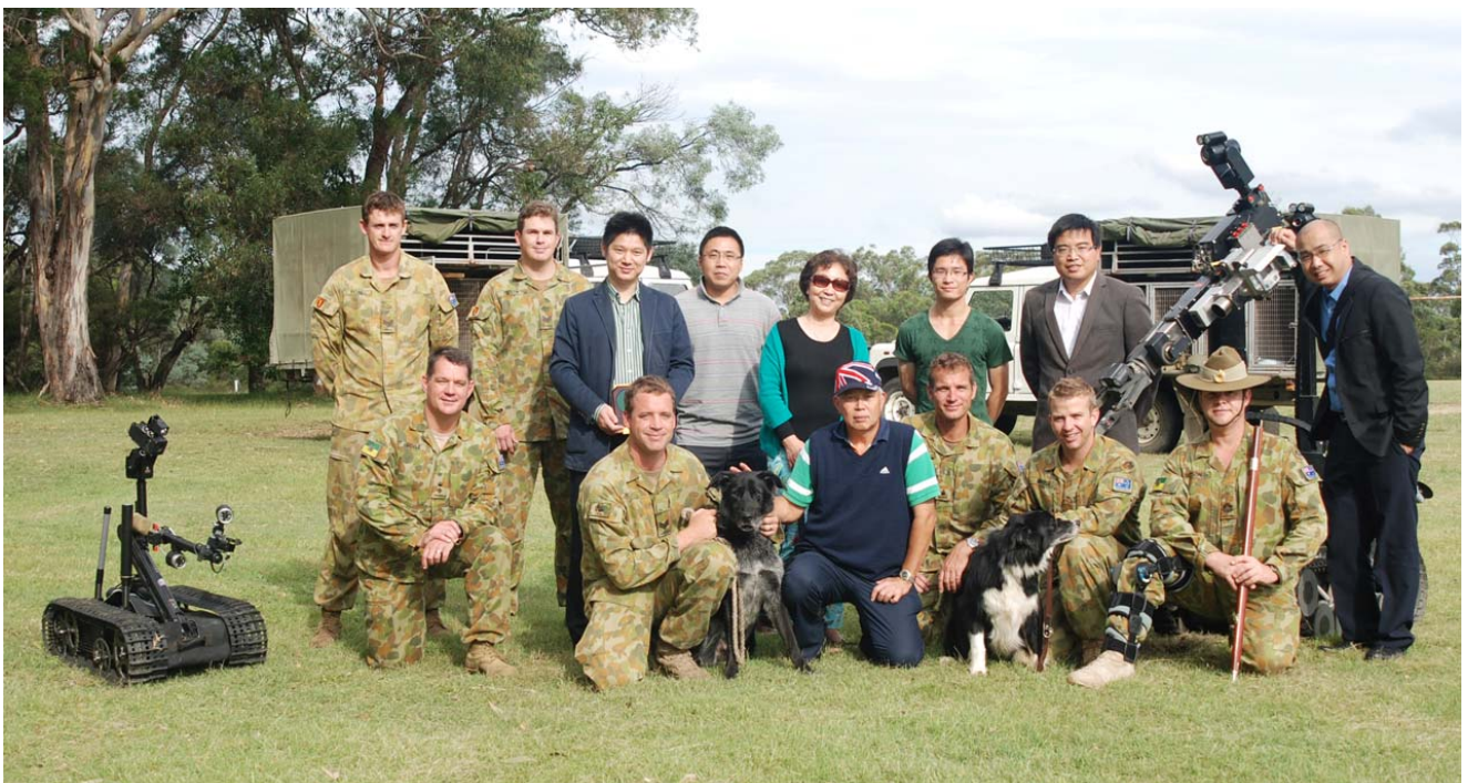
Sydney Chinese Lions and guests with members of the Army Bomb Disposal Squad

The drill commenced with a member of the bomb disposal squad showcasing his best loyal friend - a detection dog - in a bomb search exercise. The dog searched in a compound lined with an array of vehicles, in one of which an explosive device was hidden. The canine cautiously went about sniffing at the vehicles one after another, eliminating the safe ones as it went along. Finally, it accurately identified the vehicle with the hidden explosive device. It stopped searching, squatted