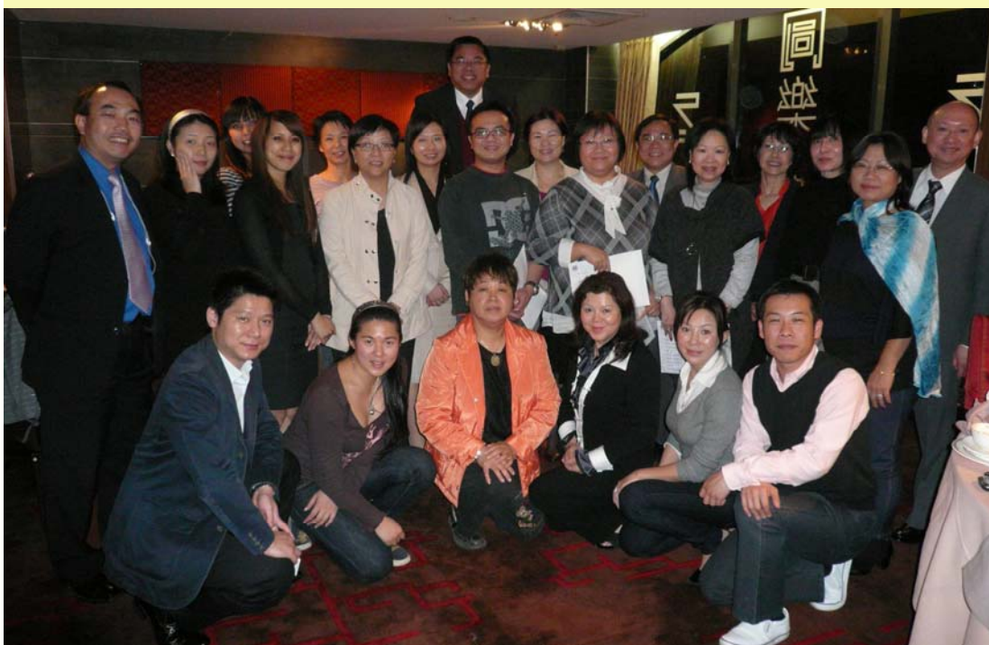
Sydney Chinese Lions and Guests at May 2010 Members Meeting