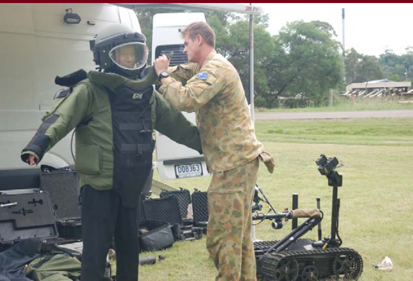
Lions donning the outfit of the Bomb Disposal Squad

In the battlefield, the bomb disposal squad performs their tasks tirelessly, selflessly and professionally, serving their country and keeping world peace. This spirit matches the Lions' motto "We Serve". It is anticipated that further interactions and cooperation will occur between the Australian Defence Forces and Sydney Chinese Lions in the future.