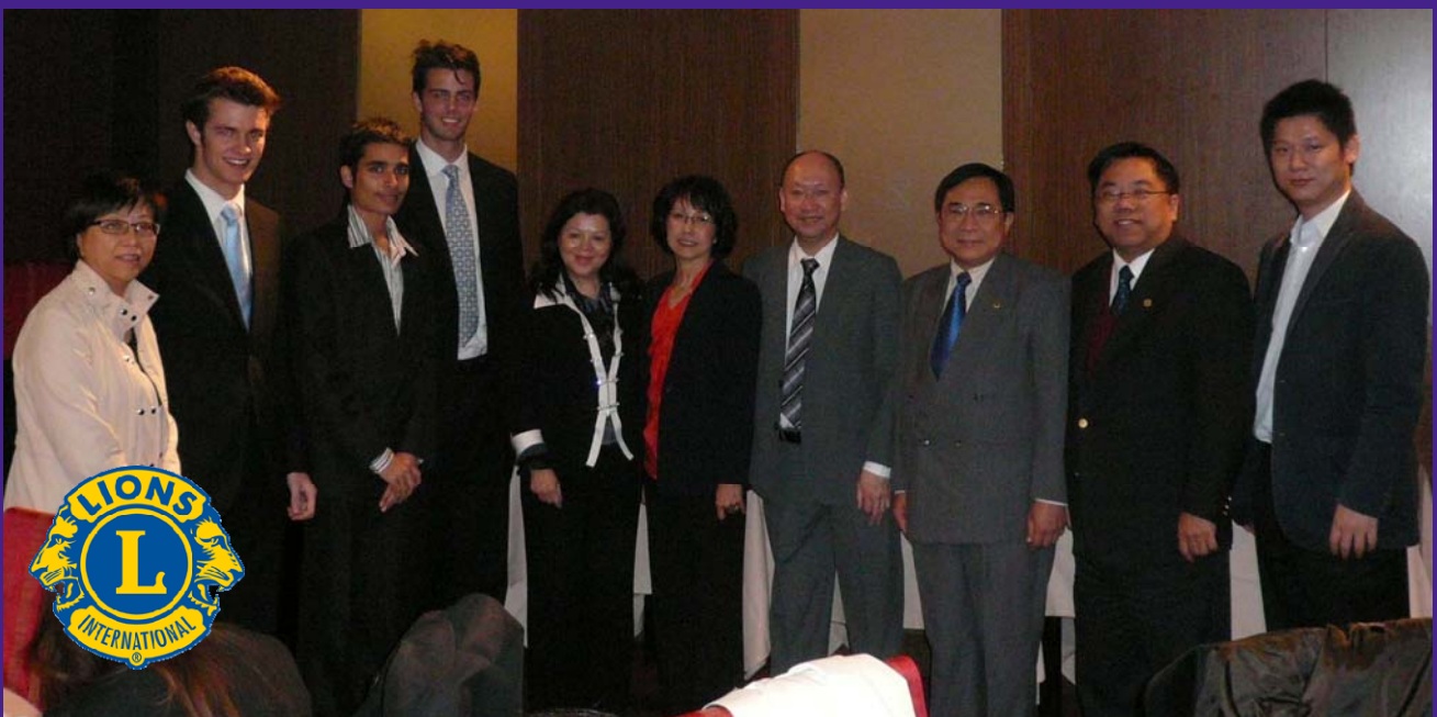
Scholarship Finalists with Adjudicating Panel at May Members Meeting