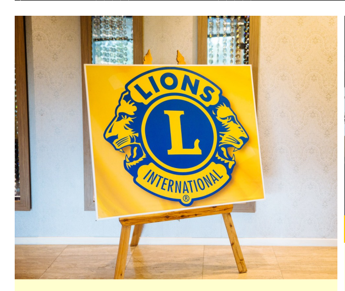
friends in N5.

We heard District and Multiple District Chairpersons talk about their portfolios.