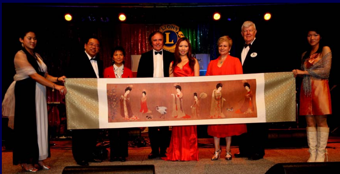
Silk Painting bought by Aleisha Zhao at $2,000