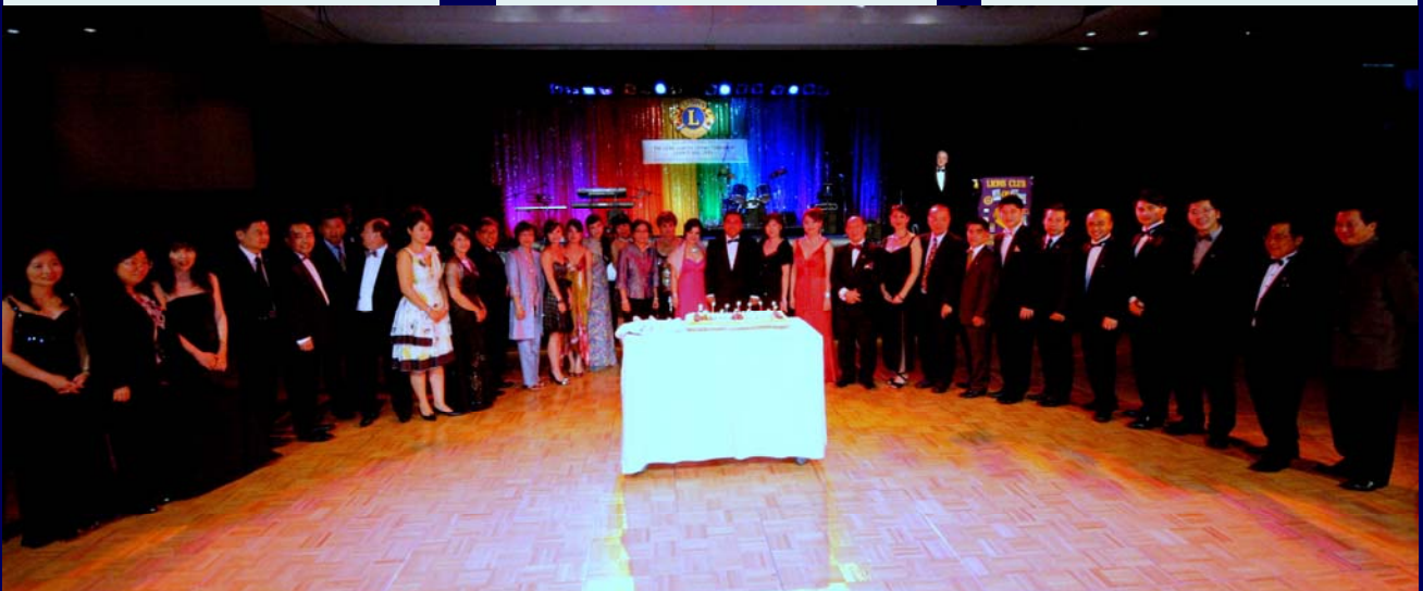
Sydney Chinese Lions Celebrating Their 14th Anniversary