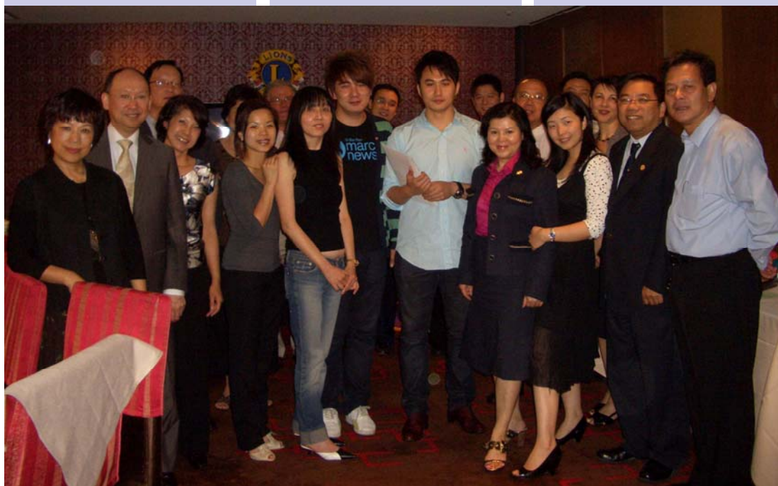
Sydney Chinese Lions at March 2009 Members Meeting