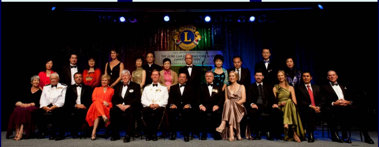
Some VIP Guests at the Ball