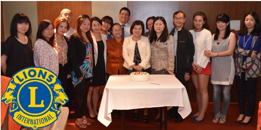
Group photo at November 2014 Member's Meeting