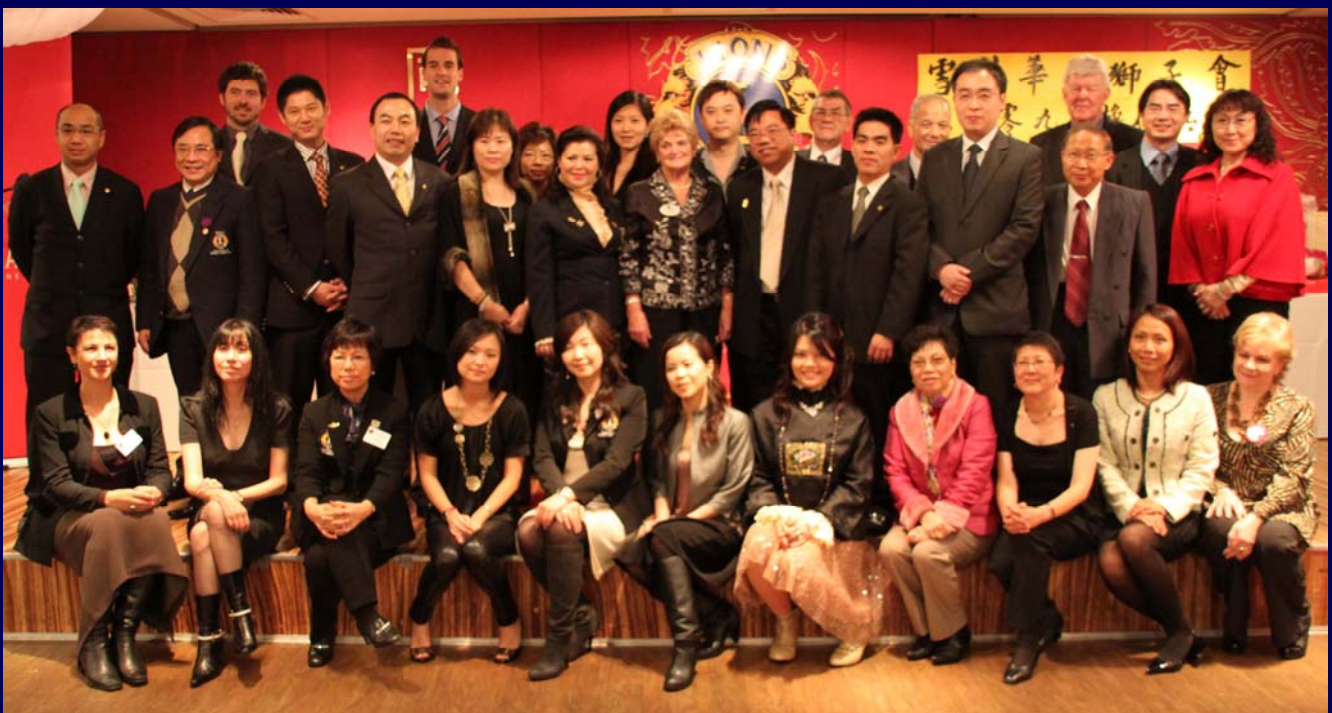
The 2009-10 Board of Directors with VIP Guests