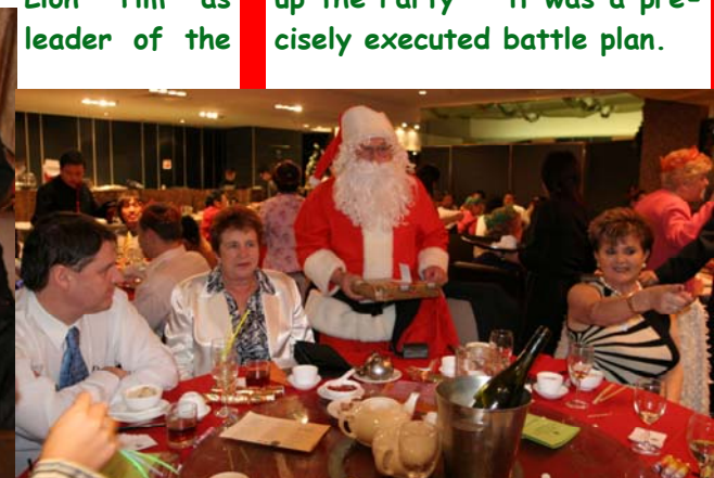
Hey there, Santa!