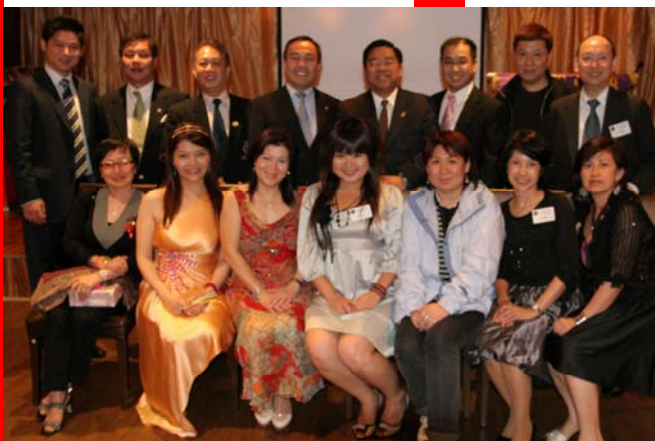
Just a few of us