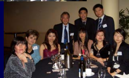
Sydney Chinese Lions at the Award Presentation