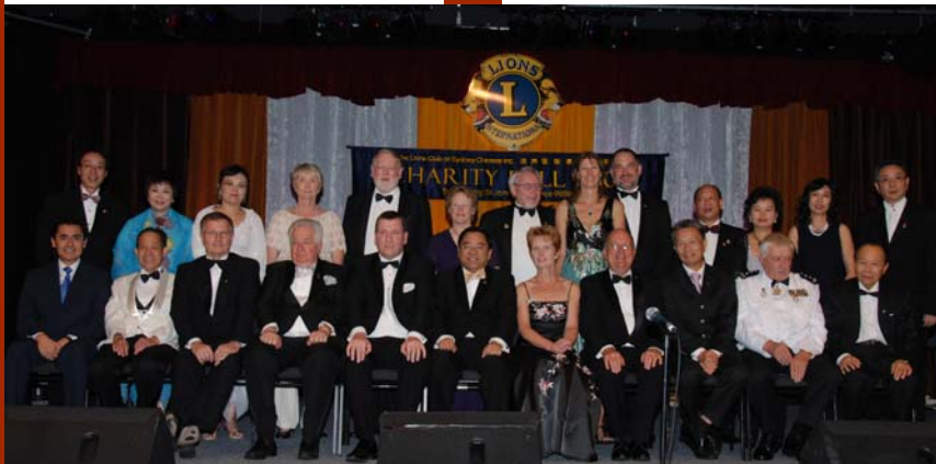
Some VIPs at Charity Ball 2007

More photos of Charity Ball 2007 can be found at the Club's website: http://www.sydchineselions.org.au/