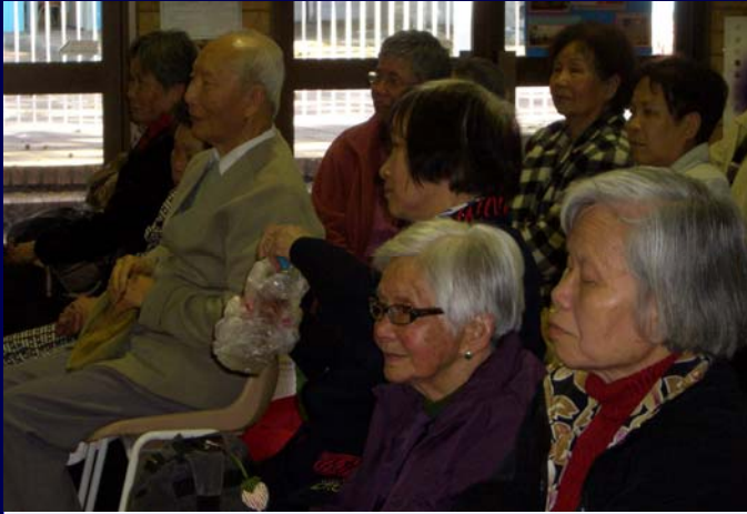
The Elderly at CASS