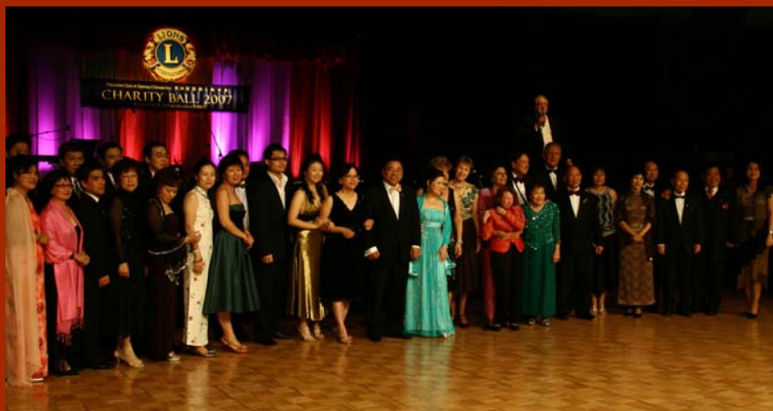
Sydney Chinese Lions at Charity Ball 2007 Sydney Convention Centre

Amongst a good number of prizes and souvenirs given out at the Ball, there were the 36-page full colour 12 th Anniversary Commemorative Booklets. They serve as a lovely memento of the celebrations. There were altogether 4 souvenirs for each attendee, 10 table prizes for each table, 36 raffle prizes, 15 silent auction prizes and 9 open auction items.