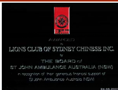
The Special Plaque Presented by St John