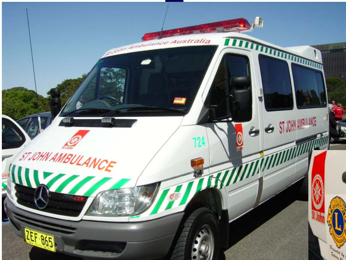
The Ambulance Donated to St John by Sydney Chinese Lions

The donation is to support St John Ambulance and its volunteer community programmes including its highly respected first aid services.