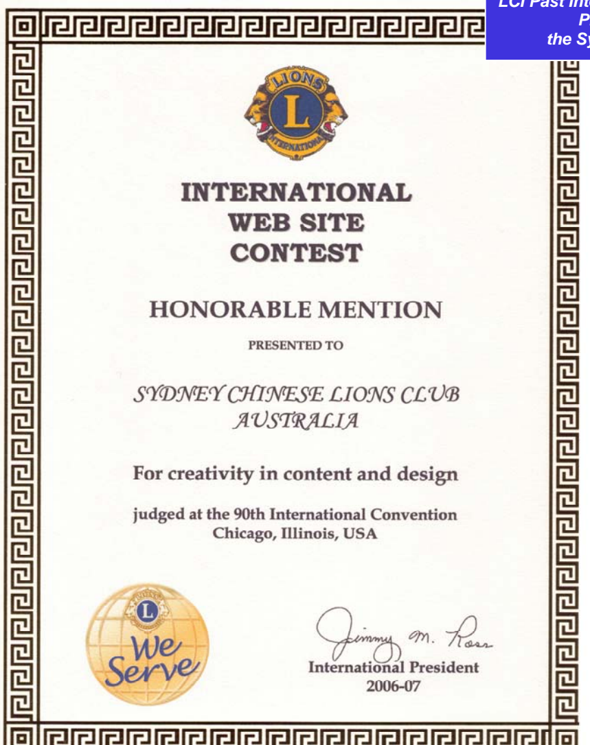
Certificate awarded by Lions Clubs International