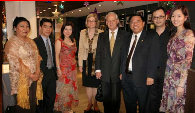
With Guests of Honour—Philip & Heather Ruddock