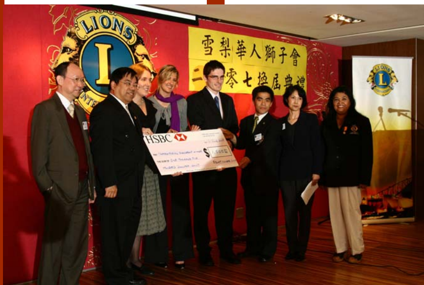
Winners of Sydney Chinese Lions Humanitarian Scholarship 2007 with the Scholarship Adjudicating Panel at the Cheque Presentation Ceremony at the Club's Changeover 2007

Another offer for the Scholarship will be made in February/March 2008.