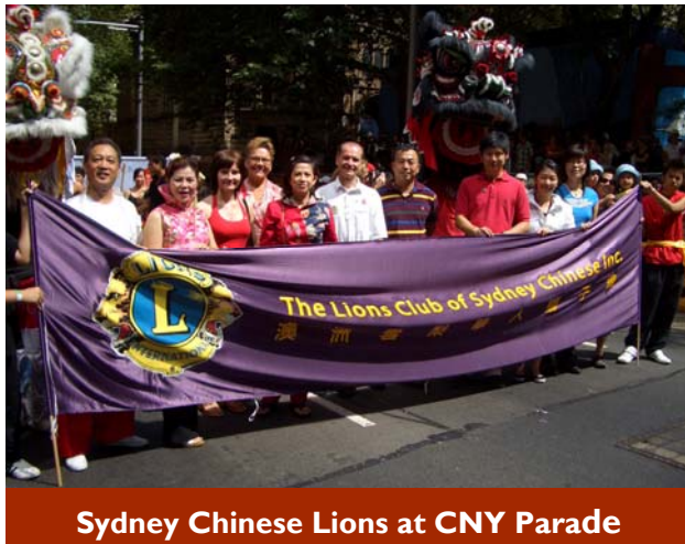
Sydney Chinese Lions at CNY Parade

On 11 February, a number of Sydney Chinese Lions took part in the Chinese New Year Parade organised by the Sydney City Council. They were joined by International Director Elect