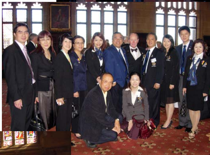
Sydney Chinese Lions at the Handover Ceremony