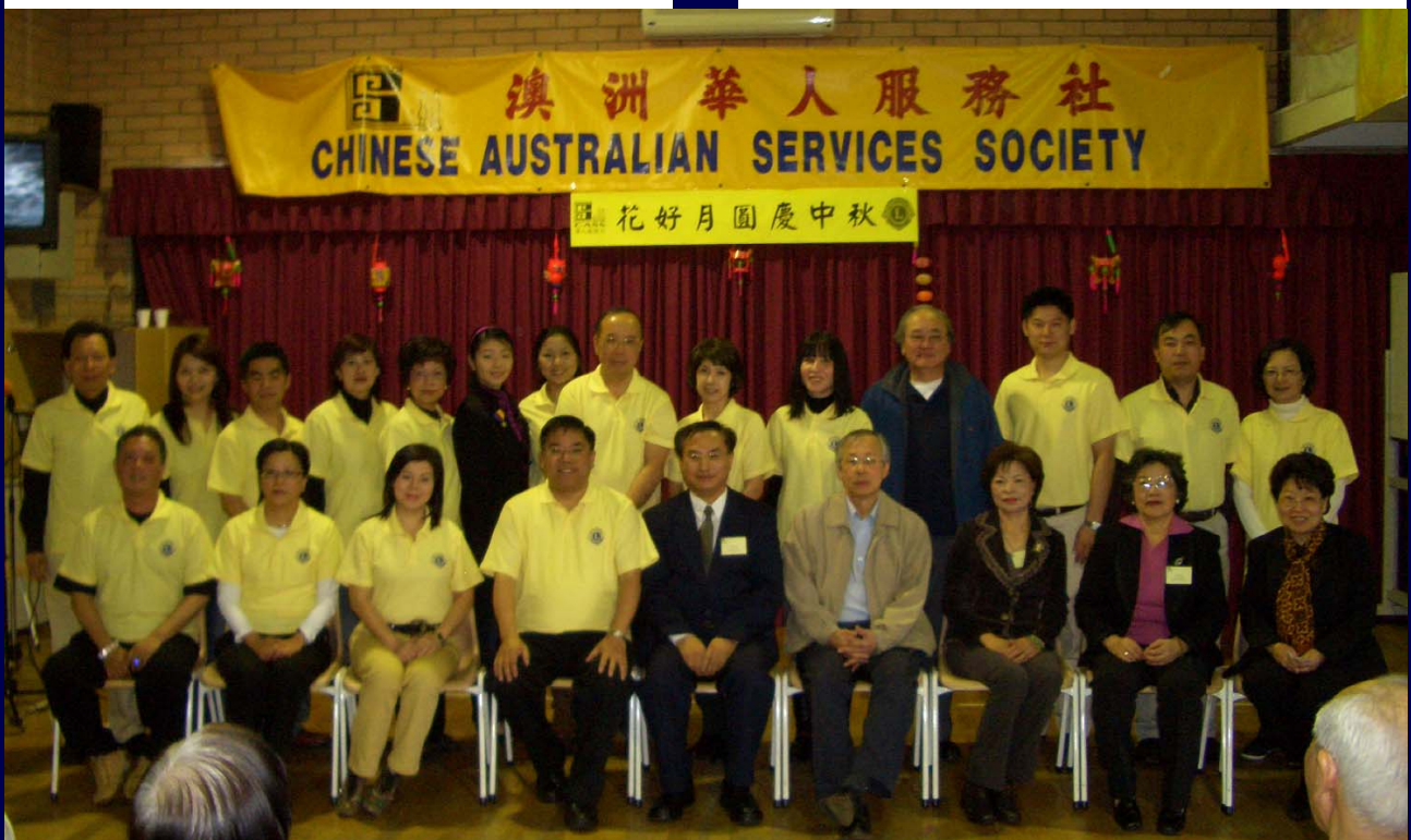
Sydney Chinese Lions with Senior Officials of CASS at their Campsie Headquarters