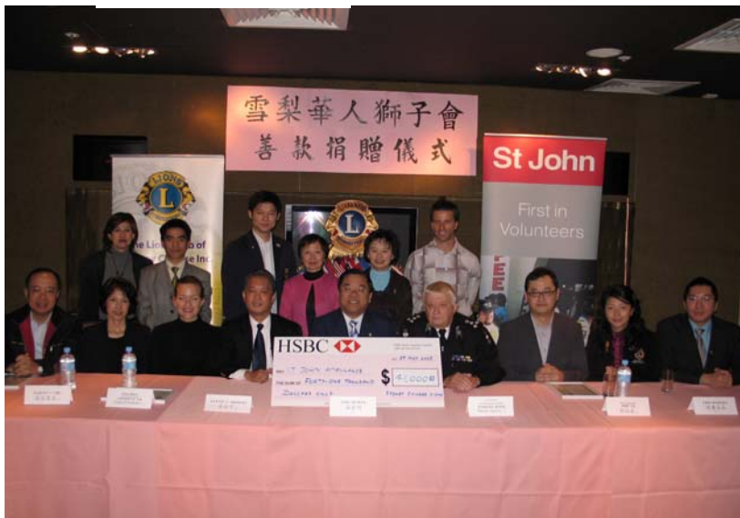
With Sponsors At Cheque Presentation Press Conference