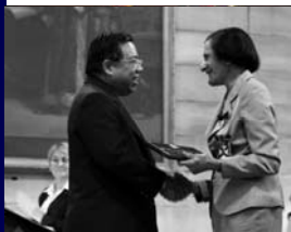
Sydney Chinese Lions Receiving a Special Plaque at the hands of Governor of NSW

"We were completely honoured that the Lions chose us to be the benefactor of their ball. Their support and generosity has meant that our volunteers can continue to provide first aid at community events and continue in the tradition of helping the sick and those who are in distress."