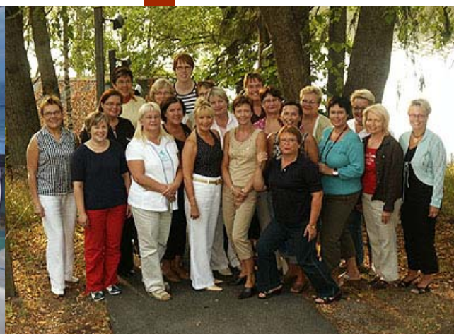
Members of LC Järvenpää/Ainot Web address: http://www.lions.fi/district107-CI/paaAinot/