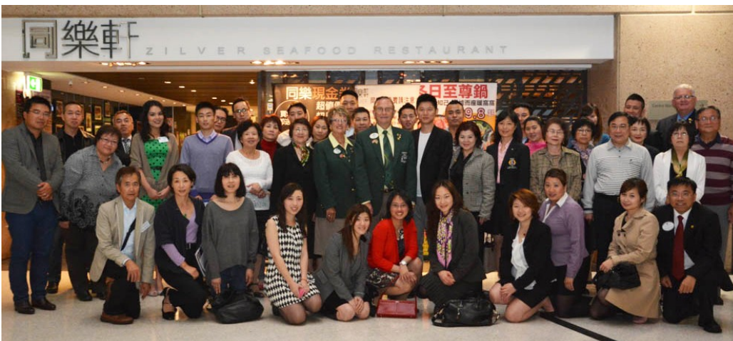
Sydney Chinese Lions and Guests at September 2013 Members Meeting