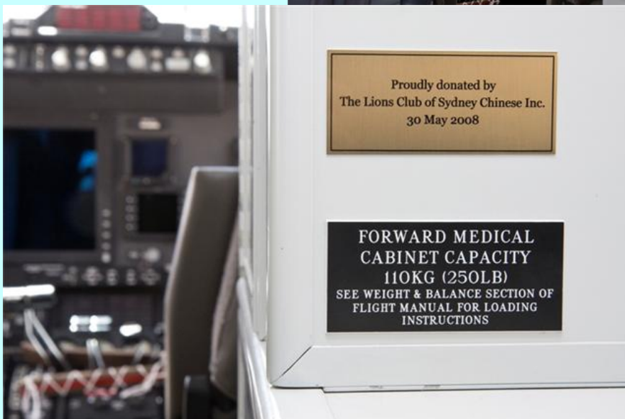
Medical Cabinet fitted on board RFD Friends with plague giving credit to The Lions Club of Sydney Chinese Inc.