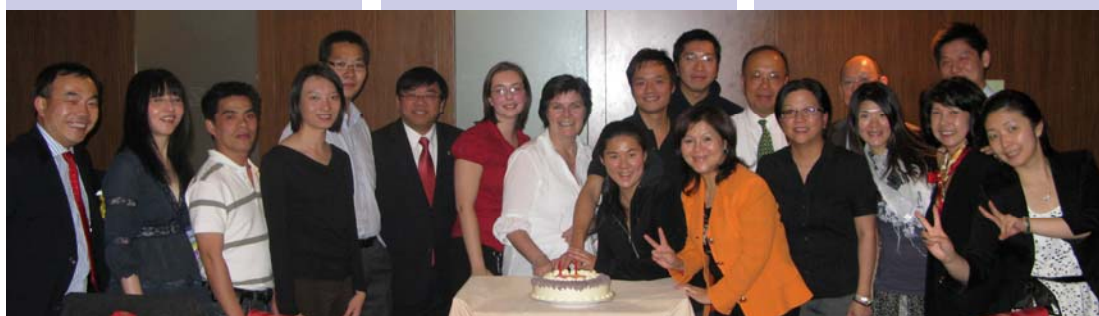
Members and Guests at November Members Meeting