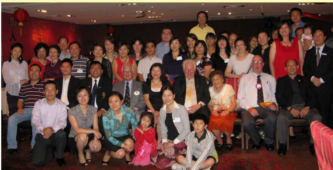
Sydney Chinese Lions and Guests at February 2010 Members Meeting

Applications for the Sydney Chinese Lions Humanitarian Scholarship 2010 are now open. The closing date is 31 March. Please see Pages 6-10 or access our website for details.