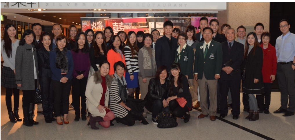
Group photo at August 2014 Member's Meeting